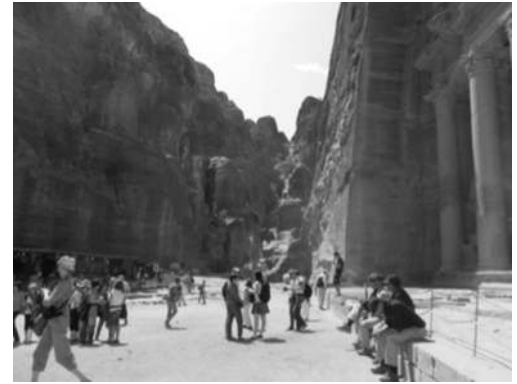
Visitors in Petra

Shop selling authentic Bedouin crafted silver in Petra.